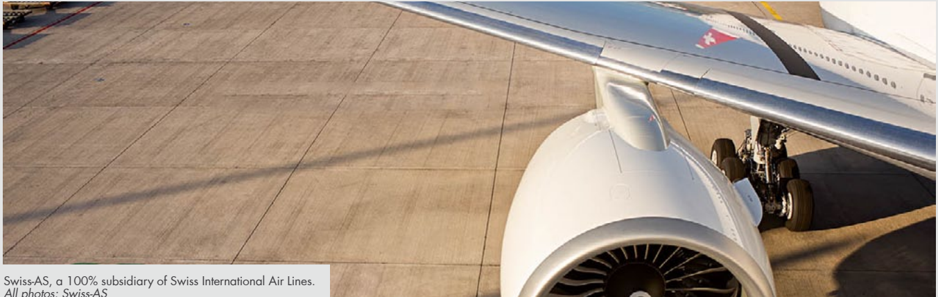
Swiss-AS, a 100% subsidiary of Swiss International Air Lines.

The MRO software solution AMOS , developed and marketed by Swiss AviationSoftware (Swiss-AS), stands for innovation, high quality and continuity due to its proven track record of success – Swiss quality at its best. Swiss-AS addresses the demands of the dynamic aviation industry by incorporating industry trends at the earliest while competing each day anew for the company’s market-leading position.